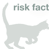
Figure 5 The number of litters produced per year in a breeding cattery is one of the key factors in determining the level of disease risk, and devising an appropriate vaccination program.

Vaccination programs for breeding catteries should be limited to those diseases that are relevant, determined by analysis of risk factors.