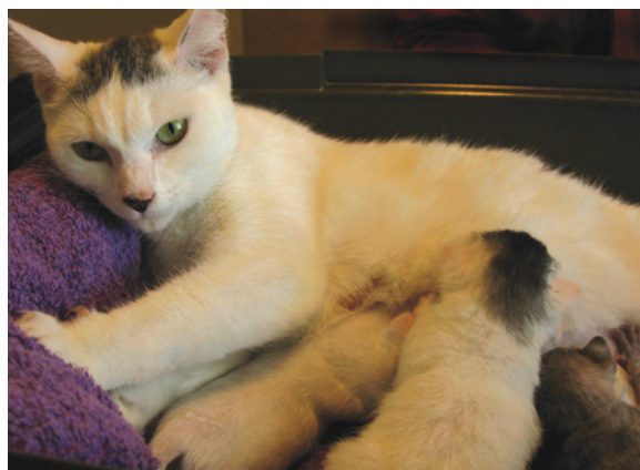
Figure 1 Kittens are more susceptible to infection than adult cats are, and are a principal primary target population for vaccination.

The risk of infection and subsequent development of disease varies with a number of factors including the age and health of the cat, magnitude of exposure to the infectious agent, the pathogenicity of individual agents, the geographic prevalence of infection and the vaccination history of the cat. Some of the factors that negatively affect an individual animal's ability to respond to vaccination include interference from maternally derived antibodies (MDA), congenital or acquired immunodeficiency, concurrent disease or infection, inadequate nutrition, immunosuppressive medications, chronic stress and an aging immune response. Additionally, some vaccinal agents (eg, FPV) will induce a much stronger protective immune response than others (eg,