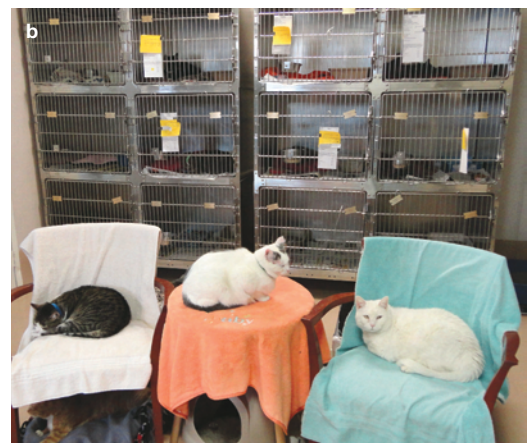
Figure 3 Generally, cats in shelters, whether individually (a) or group (b) housed, are at especially high risk of exposure to infectious disease.