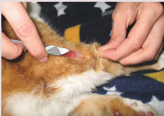
Figure 7 Administration of FPV, FHV-1, FCV vaccine subcutaneously below the right elbow.

Vaccines should be administered as low on the leg as possible. Caution is warranted when vaccinating cats resting in a crouched position as this may result in inadvertent injection of the skin fold of the flank. Veterinarians should note that data on the safety and efficacy of administering vaccines in very distal limb locations are lacking. Figure 10 shows recommended vaccination sites, as well as sites to avoid.