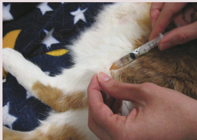
Figure 8 Administration of FeLV vaccine subcutaneously below the left stifle.