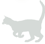
Figure 2 Pet cats that spend any time outdoors are at greater risk of exposure to many infectious diseases compared with indoor-only pet cats.

Veterinarians should reassess risk factors for exposure to infectious disease at least once a year, as changes in the health of the animal or its lifestyle may dictate modifications in vaccinations needed.