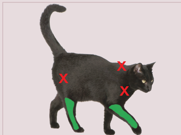
Figure 10 Regions indicated in green are recommended. Those in red are key sites that should be avoided.