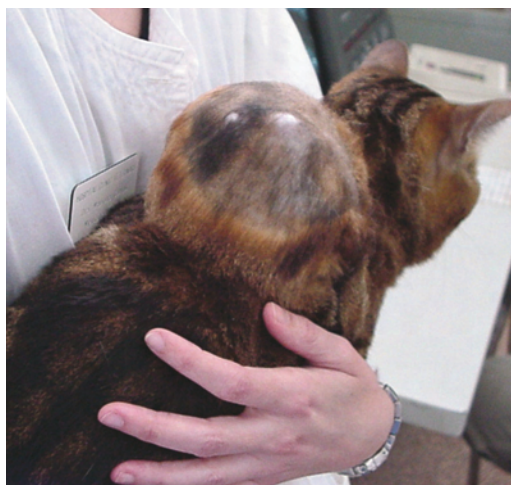
Figure 6 While vaccines are not uniquely implicated in sarcoma formation, there are certain actions that can be taken to reduce the risk of FISS, as summarized in Table 5.

FISS in individual cats presented for routine vaccination. Based on our current understanding of this problem, it is likely that vaccines are not uniquely implicated in the development of injection site sarcomas in cats. 56,60 FISS risk following vaccination likely results from a complex interaction of multiple extrinsic (eg, frequency and num-